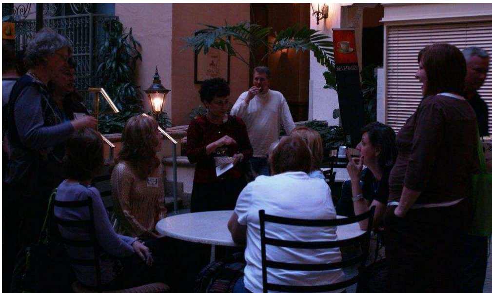
Meeting and Greeting